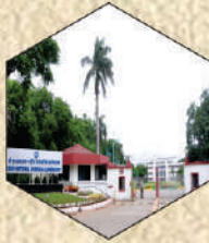
National Chemical Laboratory, Pune