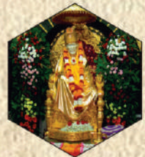
Shirdi Sai Baba, Shirdi