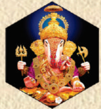
Dagdusheth Halwai Ganapati, Pune