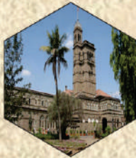
Savitribai Phule Pune University