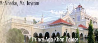
Prince Aga Khan Palace