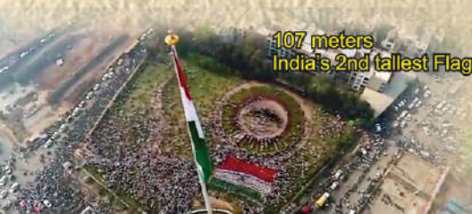
107 meters India's 2nd tallest Flag

Lonavala, Khandala, Mahabaleshwar, Panchgani, Matheran, Malshej Ghat, Kokan Beaches.